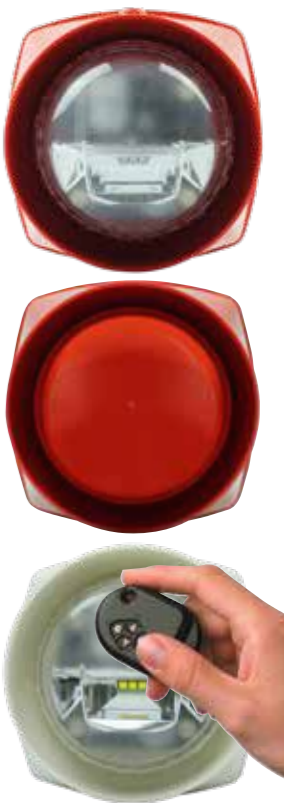
HandiLink Infrared remote control to adjust the volume remotely