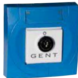
Loop powered key switch operated interface