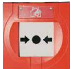
Vigilon Manual Call Point