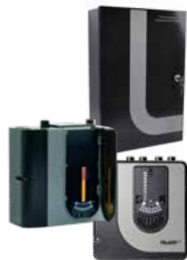
Air Sampling Detection

This type of intercom system allows emergency services to be in constant contact with the people in the refuge areas who seek assistance. The Equality Act (formerly The Disability Discrimination Act) made it the responsibility of all companies, nationwide, to ensure that access to buildings and services is available to everyone – there must be no discrimination.