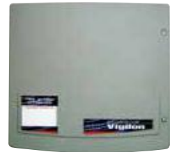
Loop Powered Mains Switching Interface