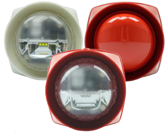
NON EP RANGE

S-Cubed offers a comprehensive range of loop powered alarm sounders with integrated voice and EN54-23 certified visual alarms. Combined with flexible configuration from the fire control panels, this loop powered device can give a differentiated combination of audible and visual alarms for alert and general evacuation.